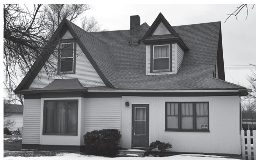
339 5th Avenue South, Glasgow

This home has a substantial presence. 1,400 sq. ft. on the main floor and 1,050 on the half story, with 5 bedrooms and 2 full baths. Affordably priced to be a remodeling or project-home dream come true. Are you looking for income property options? The house occupies a corner lot with alley access and plenty of room in the backyard. Creates a wonderful neighborhood space. Newer roof, natural gas furnace - a must see to appreciate and make your plans. Listing Price: $60,000.