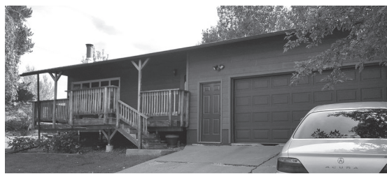
Family Home on Wedum Drive, Glasgow, MT

This spacious ranch style property boasts 3 bedrooms & 2 bathrooms on the main floor, plus a full finished basement which includes a large family room, utility room, full bathroom, and two auxiliary rooms. Plus an attached garage! Ample 2,808 total square feet of property (1,404 sq. on the main and 1,404 sq. in the basement). Currently listed at $240,000