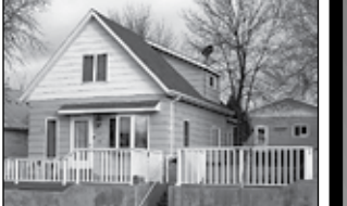
20-968 - Ideal fishing and hunting cabin for sale in the middle of Fort Peck Recreation Area. Built in 2007 high quality constructed home features 1048 sq.ft.