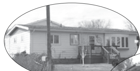
15 Perth Street 3,104+/- sq. ft. $240,000