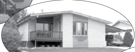
810 7th Avenue 2,944+/- sq. ft. $192,000