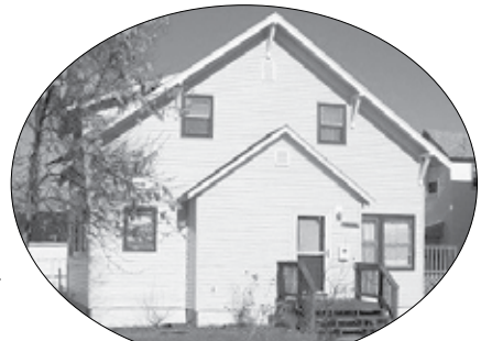
634 4th Ave. South 1,568+/- sq. ft. Only $125,000