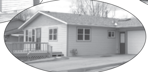
907 6th Avenue North 1920+/- sq. ft. $160,000