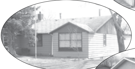
633 7th Avenue North 1,544+/- sq. ft. $75,000